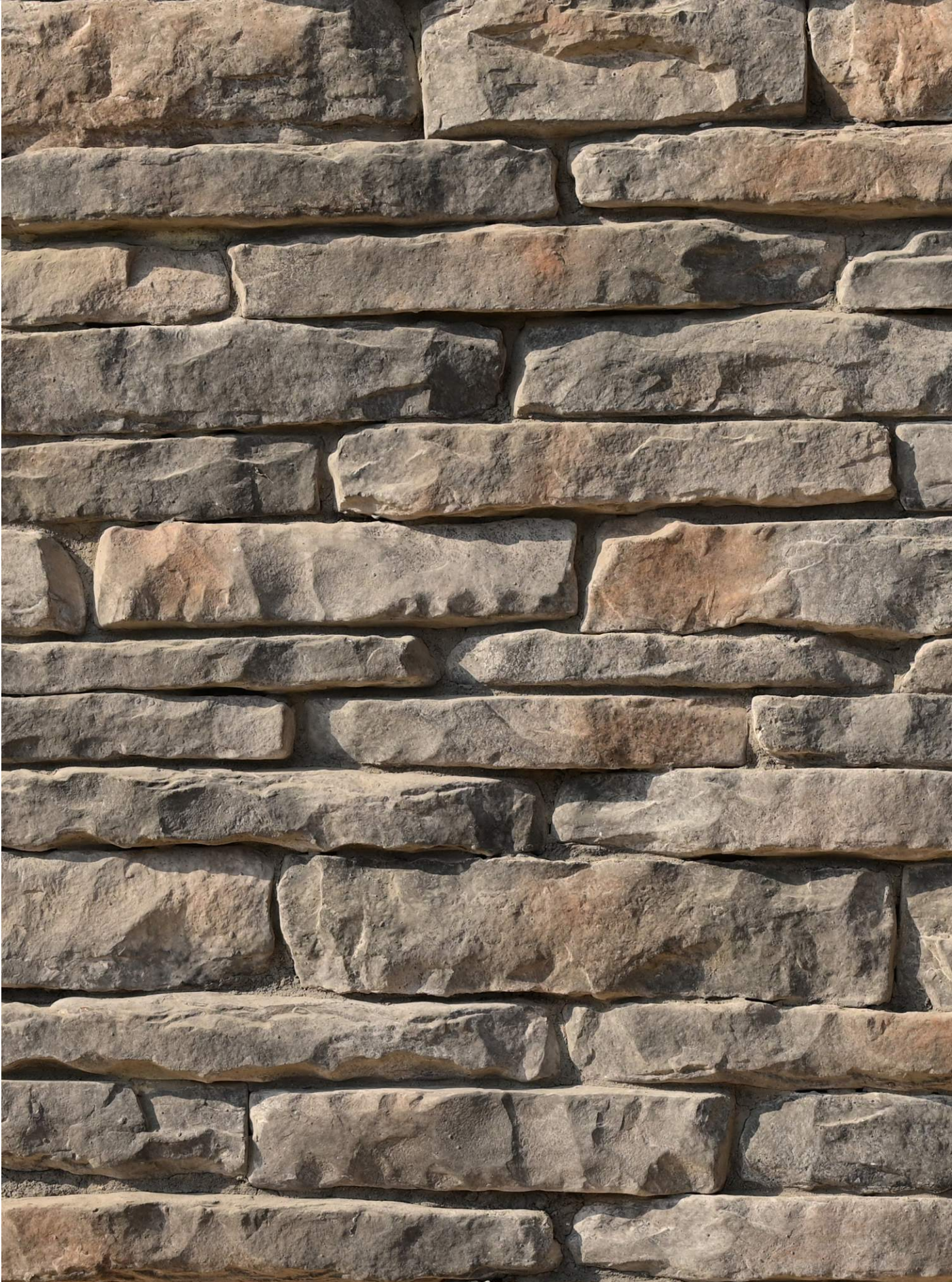
COUNTRY LEDGE-MISTY GREY