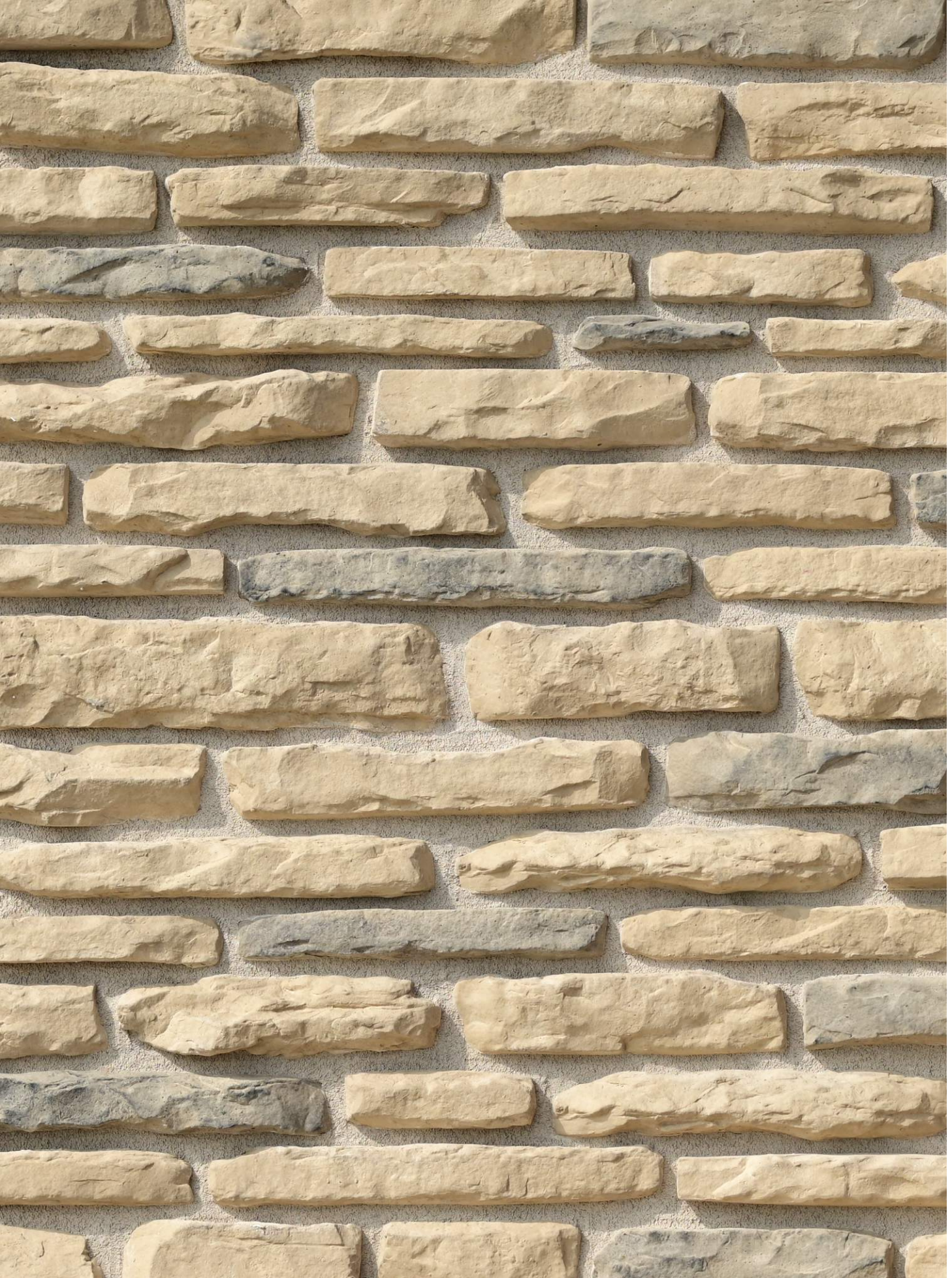
COUNTRY LEDGE-COASTAL CREAM