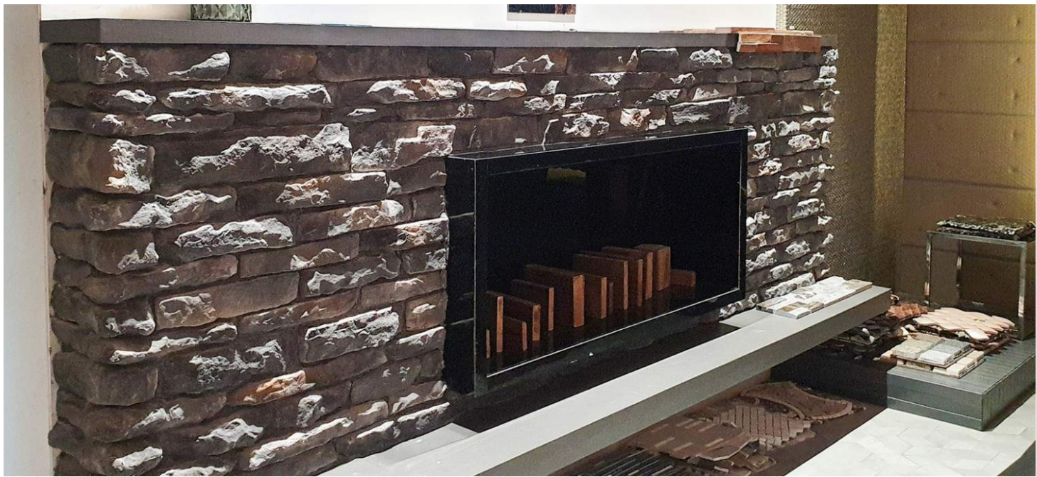
COUNTRY LEDGE-MISTY GREY