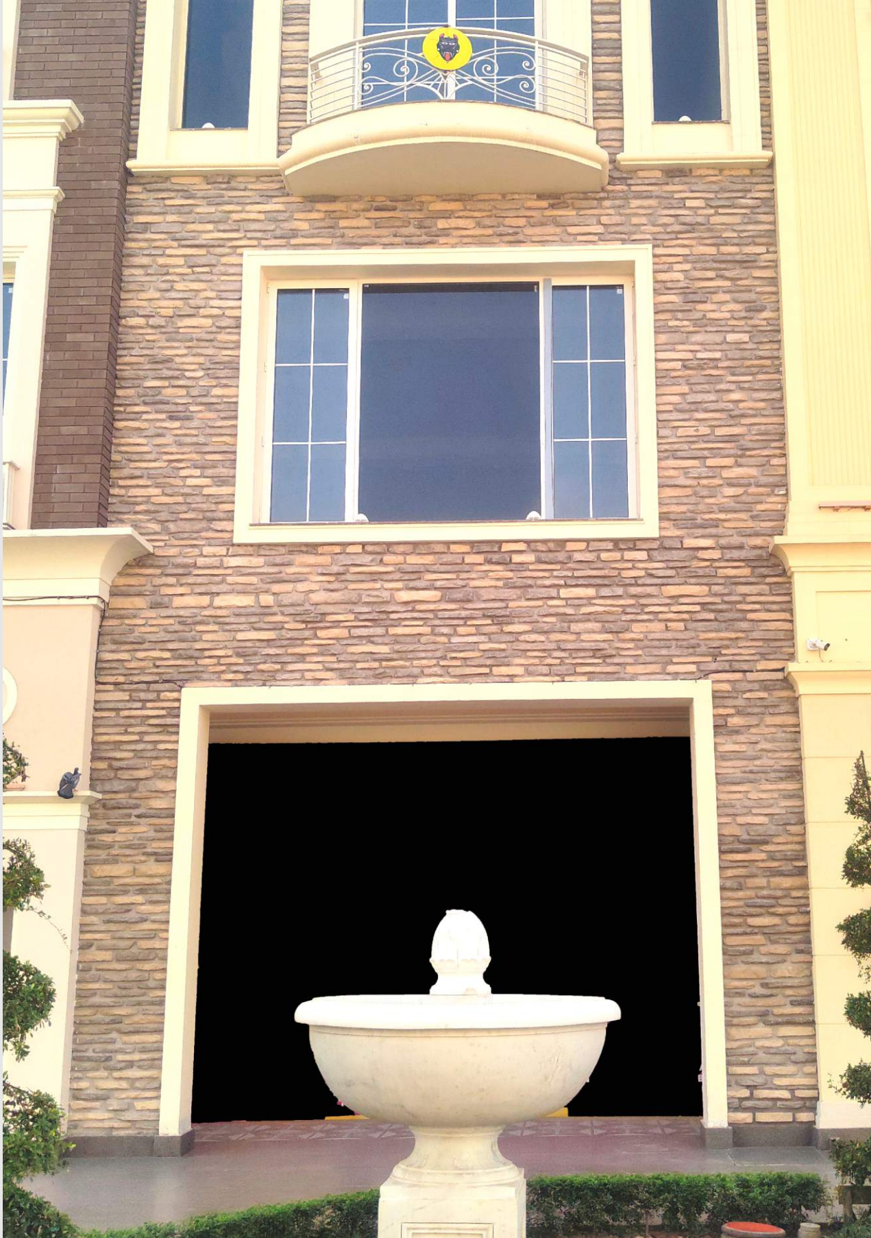
COUNTRY LEDGE-COASTAL CREAM