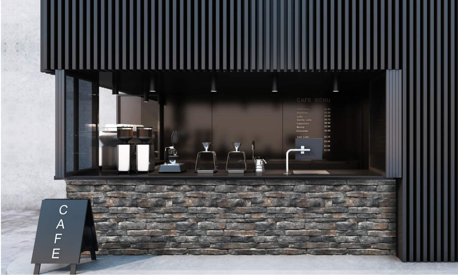
COUNTRY LEDGE-MISTY GREY