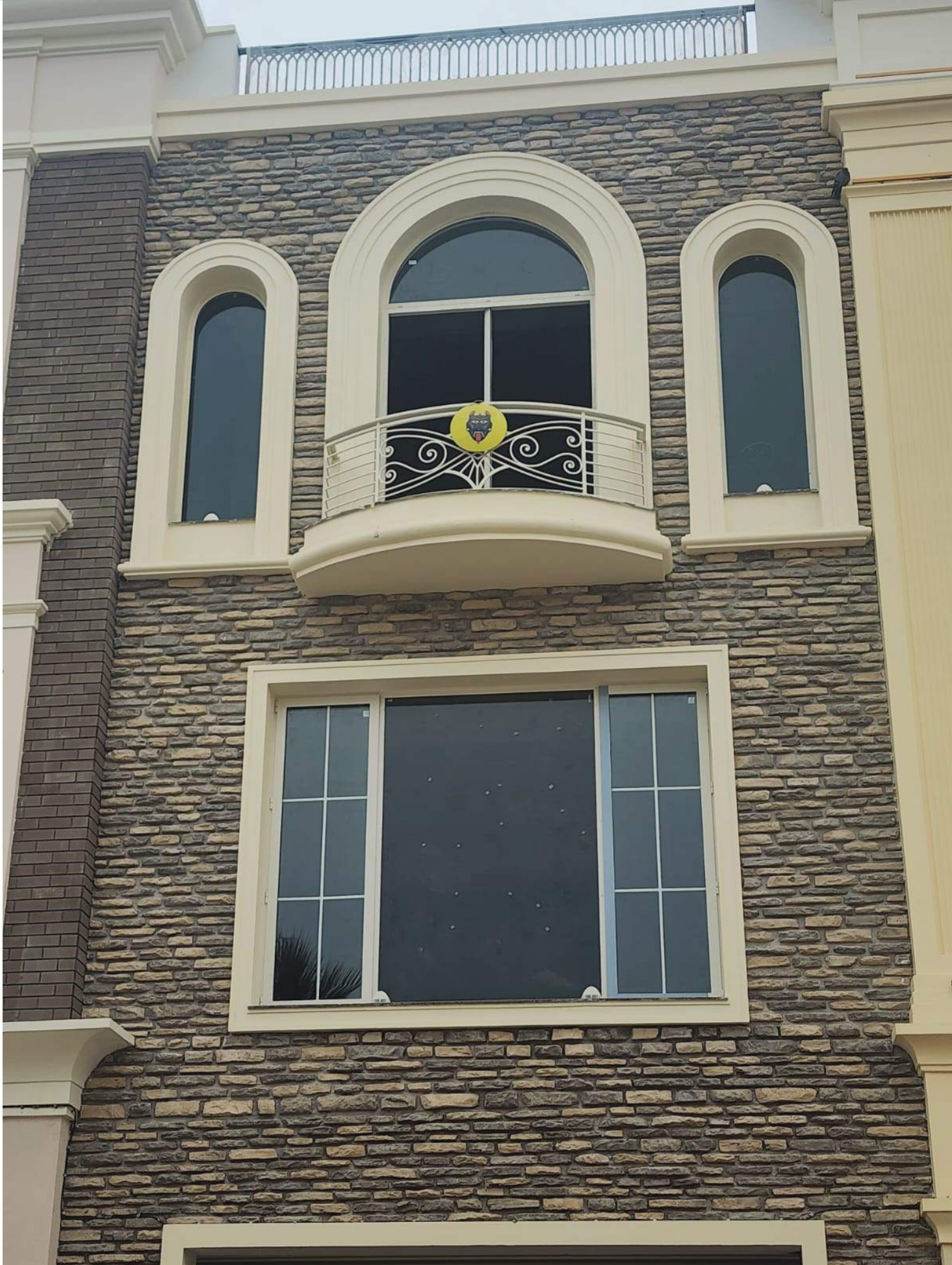
COUNTRY LEDGE-MISTY GREY